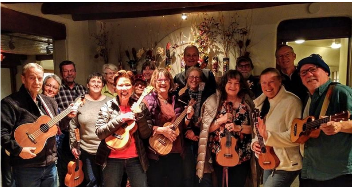
Ukulele Club Members at a rehearsal, December 3, 2018.

Club members are cordially invited to attend our first Soiree Musicale, on Wednesday, February 13 at 5:40 PM in the clubhouse.