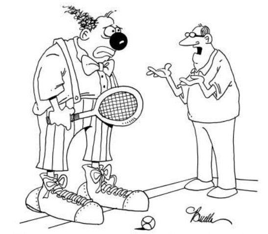
"Your serves are great. Ground strokes, superb. It's your foot faults that are killing you."